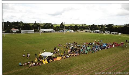
Photos from Athletics Day from Matua Brent's drone camera www.okaihau-college.school.nz/gallery